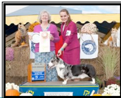
Best Jr. Showmanship