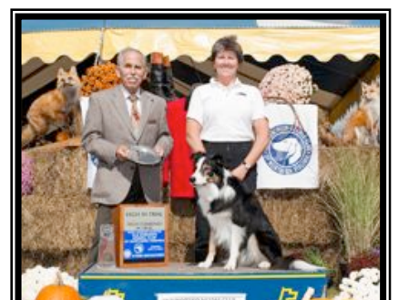
High Scoring Dog In Trial