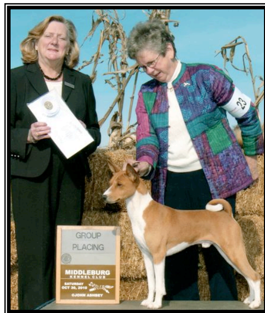
GCH Reveille Push Button Group 4 Middleburg KC