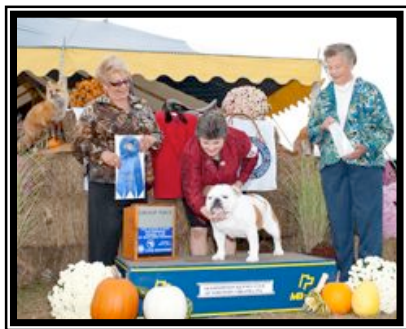
Non Sporting Group